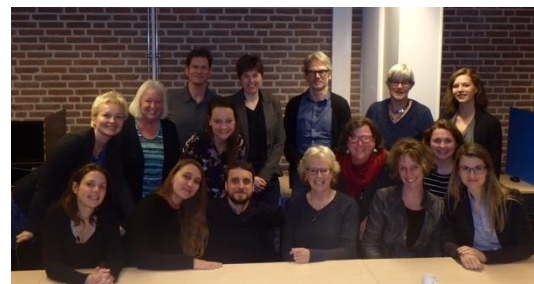
Participants at the UNICollaboration Training for the ENVOIE project in Groningen.

Members of UNICollaboration who are also EVALUATE project members ran two training events for trainee teachers involved in Initial Teacher Education in Europe and beyond.